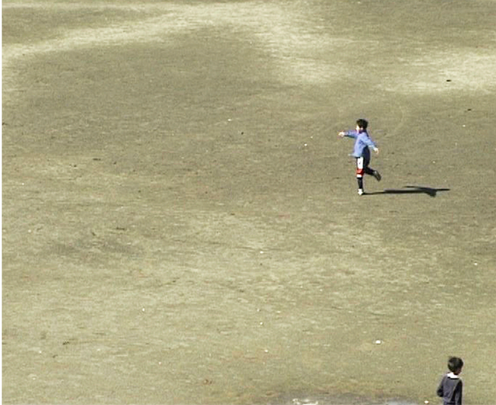
Marjan Laaper Dansende Jongen (Dancing Boy) , 2001 Vidéo, couleur, son | Video, colour, sound Durée | Duration : 2' Édition 5/10