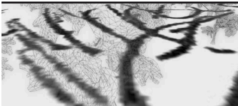
1. Hayoun Kwon