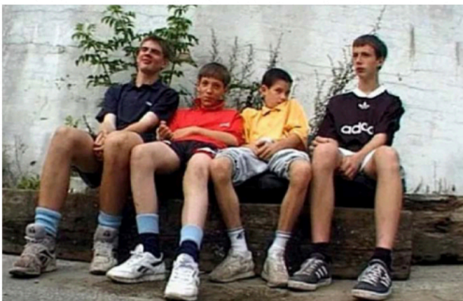
2. Gillian Wearing