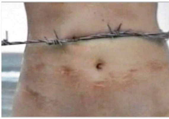
3. Sigalit Landau